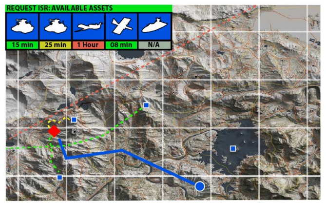
Figure 3: A notional wireframe depicting available ISR assets and their routes across platforms that are available to the human requester. Note the time to arrive on station is key to which asset may prove to be most appropriate.

The human team member has several options available. They can get a low quality image from a small fast aerial asset nearby almost immediately, or they can wait an hour or more for a larger high altitude aerial asset to provide extremely high quality imagery of the target structure as shown in Figure 3. In addition, a number of UGVs nearby can discretely augment the available aerial imagery as necessary, but may be hindered by rough terrain.